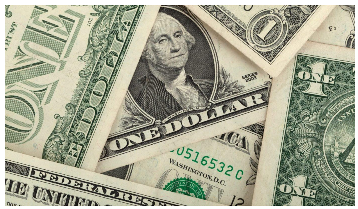
The peso has been on the rise again for a few days

After the euro broke through the 400 peso mark on Cuba's informal foreign exchange market a few weeks ago (the US dollar reached its all-time high at 395 pesos), the exchange rates of both currencies are now in free fall. The euro is currently quoted at 355 pesos on the reference portal "ElToque", while the US dollar is at 340 pesos - the lowest level since the beginning of April. What are the causes?